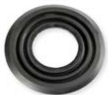
External Valve port 60885