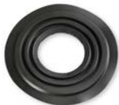
External Valve port 60895