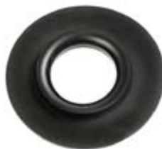
Internal Valve port 60852 - CUT